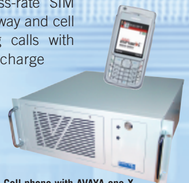
Cell phone with AVAYA one-X ECOTEL® VTM pro

ECOTEL® VTM pro handles up to 32 mobile radio modules. You can outfit the gateway with SIM cards from different carriers. Companies can use business-rate SIM cards in the gateway and cell phones, allowing calls with no per-minute charge for only a small base fee.