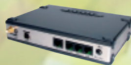
ECOTEL® GSM3-3x* ECOTEL® GSM3-3x F**