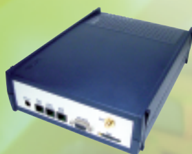
ECOTEL® GSM3-1x ECOTEL® GSM3-1x F